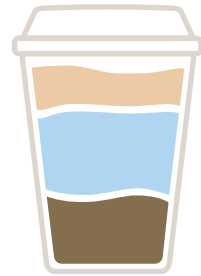
AMERICANO WITH MILK